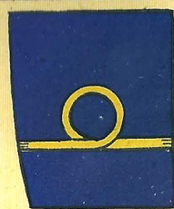
WARRANT OFFICER Cap & Badge as 11 and 2.