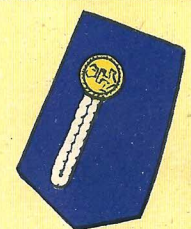
CADET Button on collar lapel.