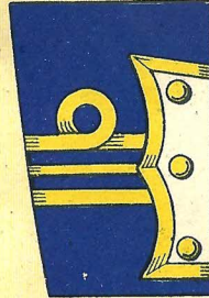
COMMISSIONED WARRANT & WARRANT OFFICERS ONLY

*Also Commissioned Officer from Warrant rank.