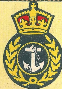
CHIEF PETTY OFFICER