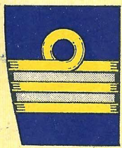
SHIPWRIGHT & CONSTRUCTORS