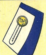
MIDSHIPMAN Patch on collar lapel.