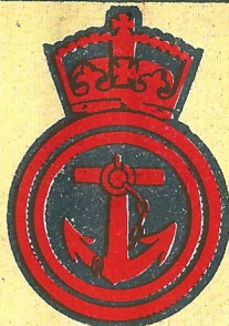
ENGINE-ROOM ARTIFICER, WRITERS, Etc.