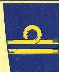
LIEUTENANT Cap & Badge as 11 & 2