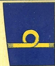
SUB-LIEUTENANT * Cap & Badge as 11 & 2