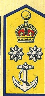
COMMODORE 1st CLASS *

*Officers of lower rank have the same design upon their shoulder straps as upon their sleeves. Engineer and Surgeon Vice and Rear-Admirals and Paymaster and Instructor Rear-Admirals have suitably coloured edging—purple, red, white and light blue respectively.