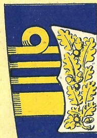
FLAG OFFICERS & COMMODORES 1st CLASS

The foregoing cuffs, and the remainder given on pages 3 & 5, are those worn with the undress uniform. The three examples below, viz., Admiral, Commodore 2nd Class, and Warrant Officer, show the three styles of full-dress cuff with "slash" as worn by all Commissioned Officers. The rows of "distinction lace" vary in number and style for the different ranks and branches, exactly as on the cuffs of undress uniform.